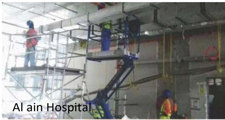
Al ain Hospital