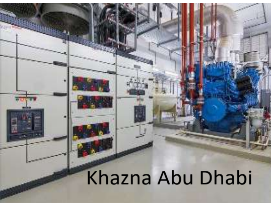
Khazna Abu Dhabi