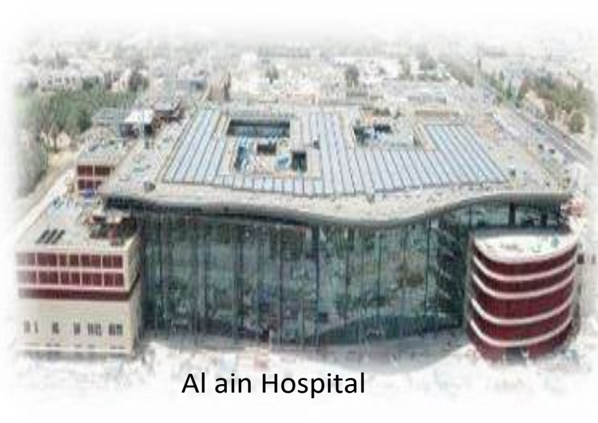
Al ain Hospital