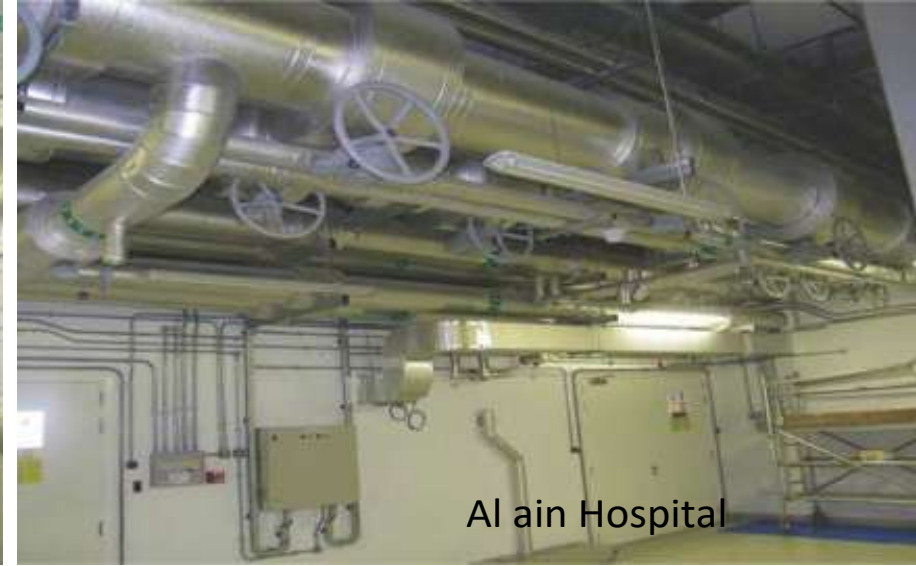
Al ain Hospital