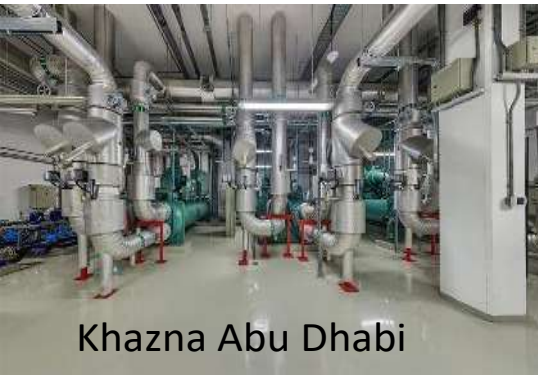
Khazna Abu Dhabi