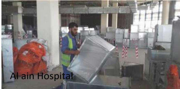
Al ain Hospital