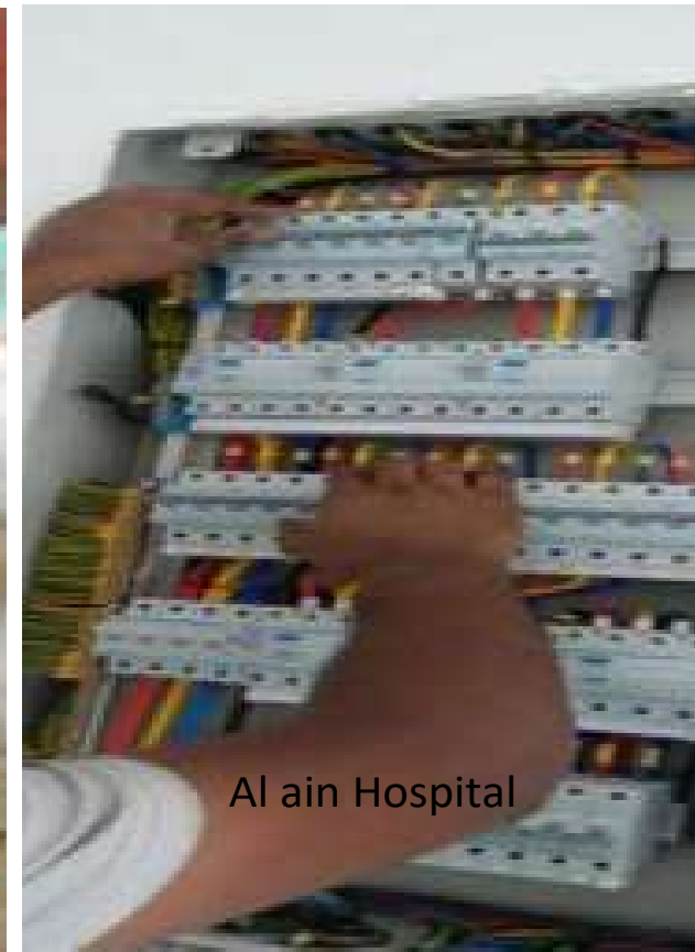
Al ain Hospital