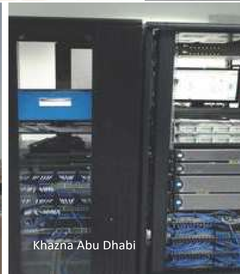
Khazna Abu Dhabi