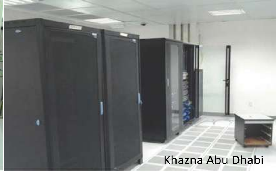
Khazna Abu Dhabi