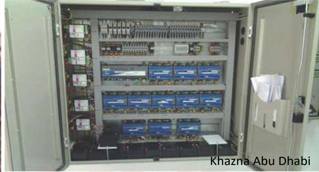
Khazna Abu Dhabi