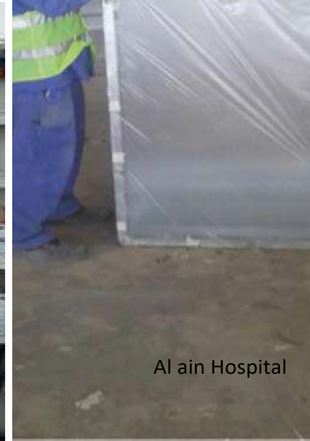
Al ain Hospital